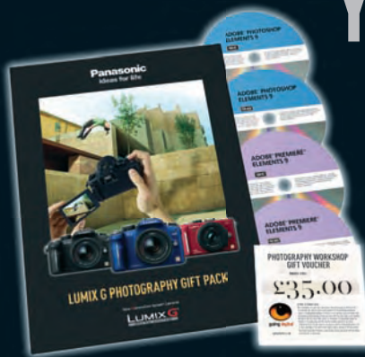
Illustration of gift pack