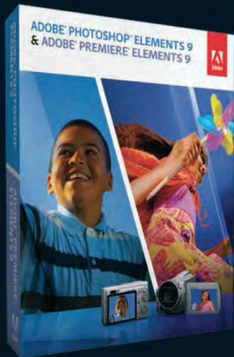
For illustration purposes only

Facebook and the Facebook logo are registered trademarks or trademarks of Facebook Inc.